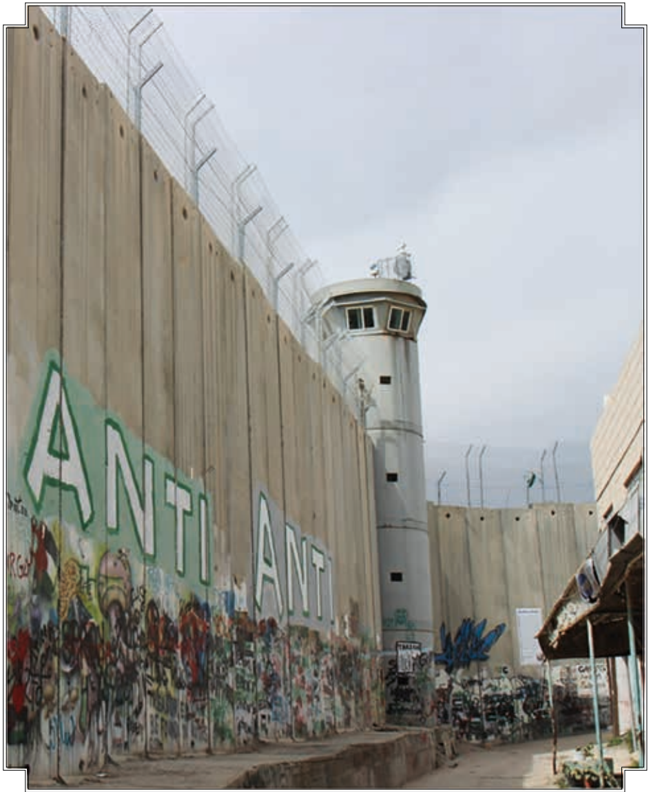
Beneath a Watchtower